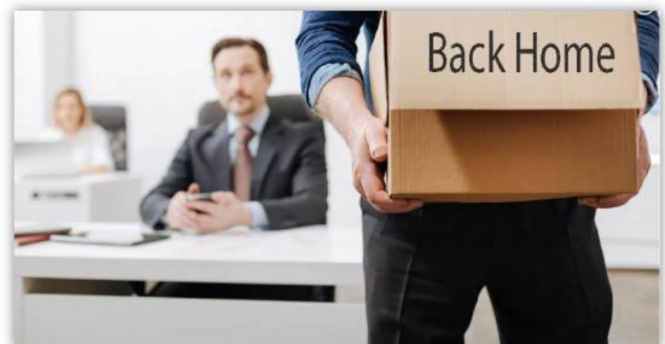
Avoid the chance to see this picture become reality. Balance life-work is the most important reason for a worker to stay loyal to a company.

We understand the confusions and chaos the expatriates face when they move to a new city or country. The norms of the society, the traditions of the community living there, the lifestyle the neighbors are attuned to, etc. might be very different than what they were earlier used to. CUSMA Group provides your new workers with detailed orientation programs to settle-in comfortably, and integrate into their new country to call it Home.